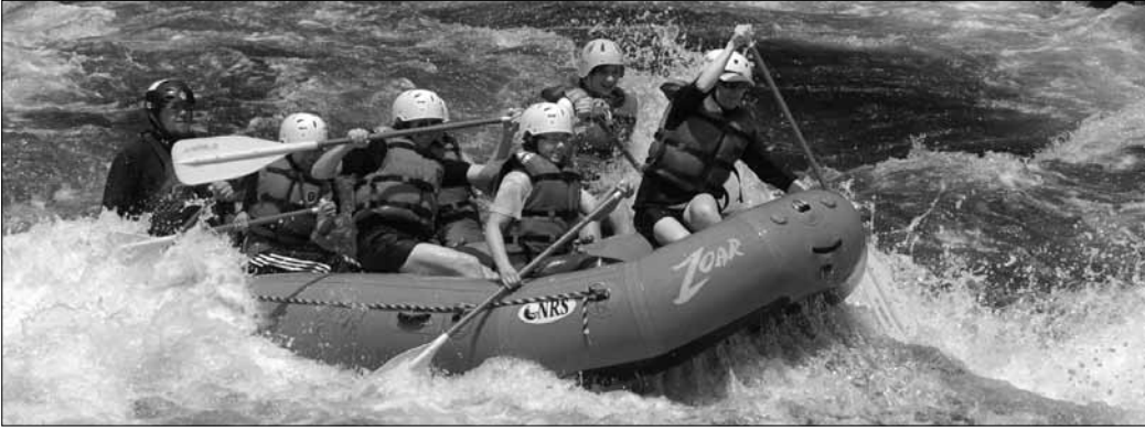
Participants in Brattleboro, VT challenge themselves with white-water rafting