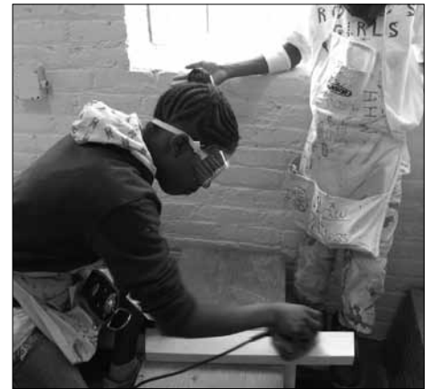
Wood working in Cincinnati, OH

The National Parks Service in Richmond, CA – home of the Rosie the Riveter/World War II Home Front National Historical Park – joined forces with the YMCA of the East Bay and numerous local supporters to bring to life the city's ship building history in its Rosie's Girls program. Using their carpentry skills, Richmond Rosie's Girls