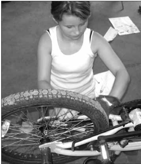
Bike repair in Essex, VT

The Rosie's Girls program in Bennington has "gone green." The program's core trades activities centered on alternative energy