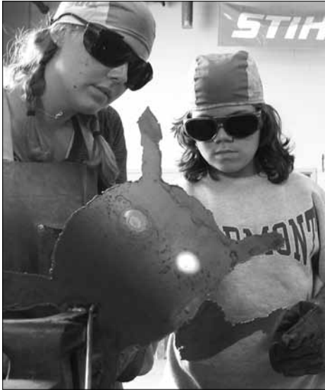
Welding is some serious fun in Essex, VT

For the 10th summer, middle school girls across the country had a chance to get their hands dirty – building, welding, firefighting, climbing, boxing, creating – while developing a broad sense of who they are and what they can become. Over 250 girls participated in 12 sessions in 11 locations across the country between June 15 and August 21. Four sites ran their first programs this summer – Weld-Ed at Lorain Community College in Elyria, OH; Richmond, CA; Proctor, VT and Bennington, VT.