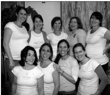
BCE Steering Committee Members

Vermont Works for Women was honored to be chosen as the beneficiary of this year's Burlington Clothes Exchange. More than 500 women turned out to shop the May event