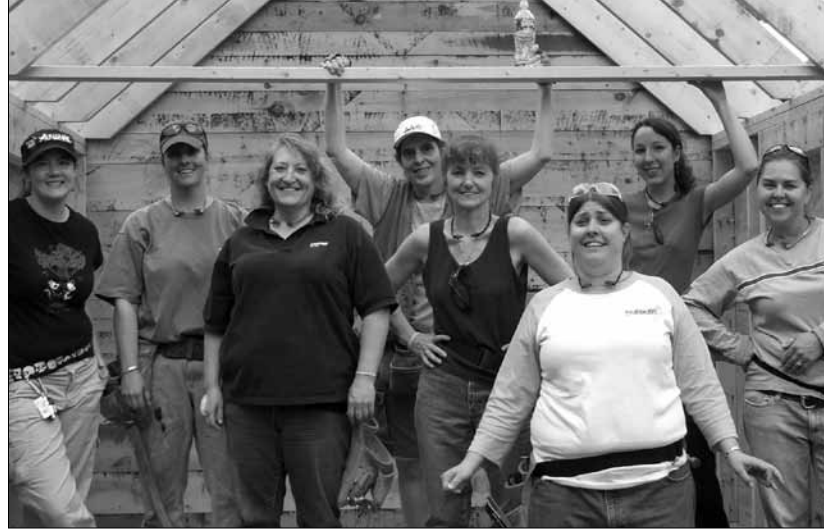
Half way through the course, the class shows their pride in their structure

The hands-on building days allowed students to gain experience in a wide variety of the basic hand and power tools, planning and design, framing, roofing, window installation and trim work through their work on an 8x10 garden shed. An important element of the class—job shadows with area contractors—went exceptionally well and the majority of students opted to volunteer many more hours than what was required, with some students contributing 40-70 hours of their time on job sites with our employer partners. Two graduates were able to gain more experience while building a counter top for the Intervale Foundation in Burlington. One graduate has already been hired by a construction company in her home region of Franklin County. ■